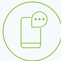
How to contact 988