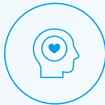
What is 988