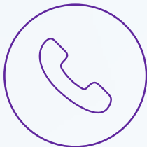
When to contact 988