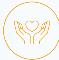
How 988 can help